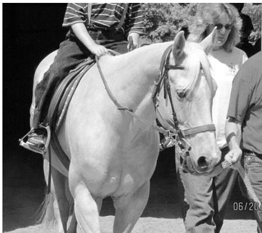
Nugget & rider having fun!