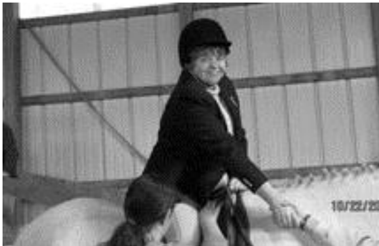
The Therapeutic Equestrian Center Newsletter